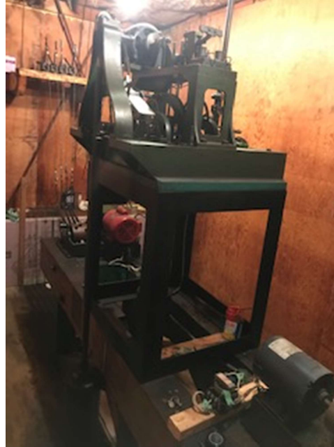
2024 - Verdin Clock Movement