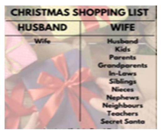
Blessings 2024 - Reverend Steven